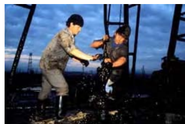
Industrial and agricultural sectors will also benefit from the diaspora’s business skills and investment