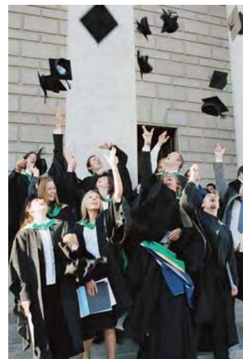
Universities will benefit from the scholars and lecturers from abroad

The Brain Gain Programme will also explore job creation and the labor market situation in Albania in an effort to provide the Government with a sound long-term strategy for employment and job creation. The Programme will serve as an umbrella for the efforts of IOM, ETF, and OSFA undertaking specific survey research in employment demand, emigrant employment and job creation.